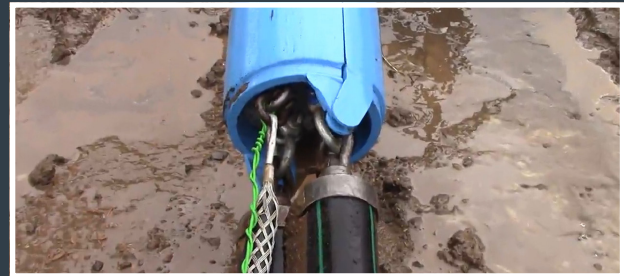
8" MULTI-PIPE PULLER