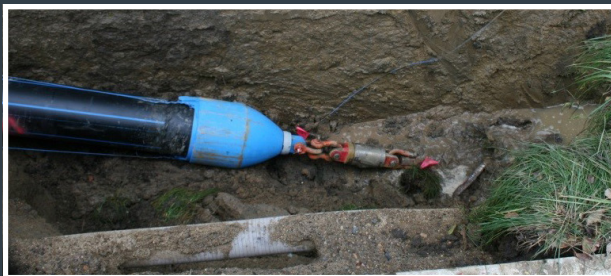
12" QUICKCONNECT PULL HEAD W/ HDPE