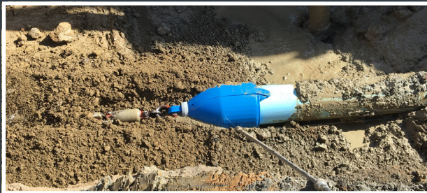
12" PULL COLLAR W/ FPVC