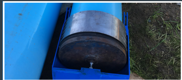
12" PULL COLLAR W/ FPVC